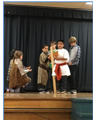
Lenten Stations of the Cross