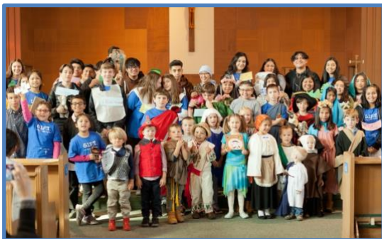
Celebrating All Saints Day!

We very much look forward to building our community of faith together! God bless you!