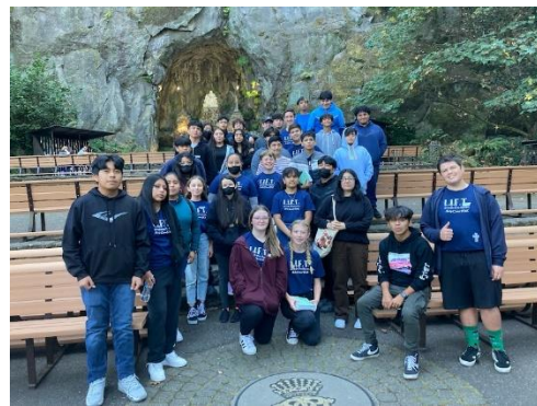
Teens on Confirmation Retreat, 2022