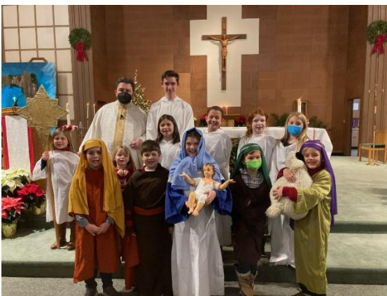
Children participating in Christmas Family Mass, 2022

We very much look forward to building our community of faith together! God bless you!