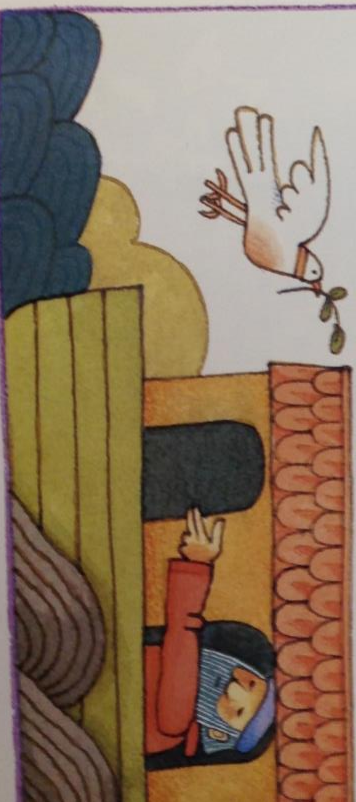
Noah and the G

After forty days Noah opened the window he had made in the ark and sent out a raven, and it kept flying back and forth until the water had dried up from the earth. Then he sent out a dove to see if the water had receded from the surface of the ground. But the dove could find no place to set its feet because there was water over all the surface of the earth, so it returned to Noah in the ark. He reached out his hand and took the dove and brought it back to himself in the ark. He waited seven more days and again sent out the dove from the ark. When the dove returned to him in the evening, there in its beak was a freshly plucked olive leaf! Then Noah knew that the water had receded from the earth. He waited seven more days and sent the dove out again, but this time it did not return to him.