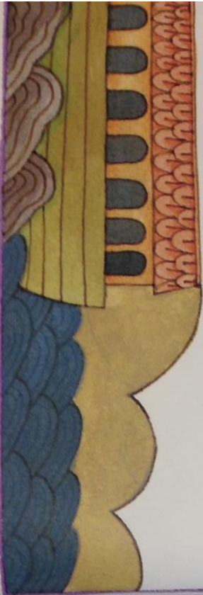
Noah and the Great Flood

The waters flooded the earth for a hundred and fifty days. But God remembered Noah and all the wild animals and the livestock that were with him in the ark, and he sent a wind over the earth, and the waters receded. The water receded steadily from the earth. At the end of the hundred and fifty days the water had gone down, and on the seventeenth day of the seventh month the ark came to rest on the mountains of Ararat.