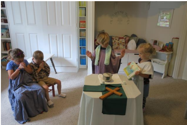
The overall Mass scene.